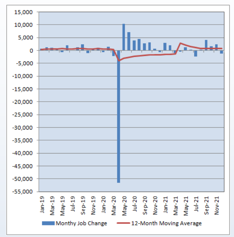
Figure 1: Monthly Change in Employment in Virginia's Health Care & Social Assistance Sector, Seasonally Adjusted.