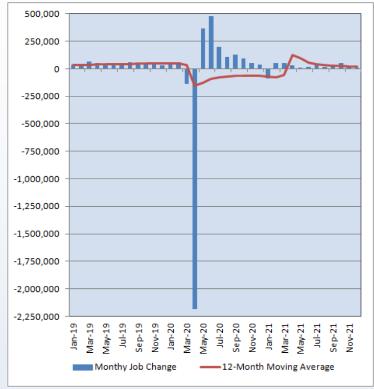
Figure 3: Monthly Change in Employment in National Health Care & Social Assistance Sector, Seasonally Adjusted

A similar trend occurred with respect to the overall national economy as well. After creating 648,000 jobs across the country in October, the overall national economy produced only 249,000 and 199,000 jobs in November and December, respectively. December's employment gain translates into a 1.6% annualized growth rate. Despite this slower growth over the past two months, national total nonfarm payroll employment has still increased by an impressive 6.4 million in 2021, which represents a 4.5% growth rate.